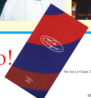
The last Le Cirque 2004 menu