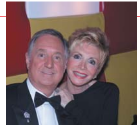
Mr. and Mrs. Neil Sedaka