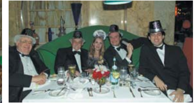
Black Tie wishes a Happy New Year to all.