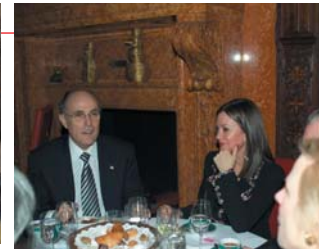
Rudy Giuliani and Judith Nathan bring in the New Year